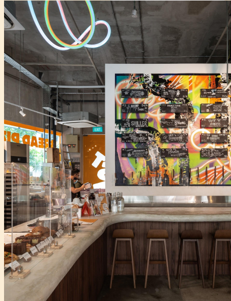
YEASTSIDE @ FARRER PARK 2 Perumal Rd, #01-06, S218773